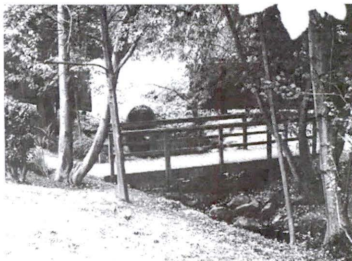
Massey Creek flows next to an complex apartment parking lot

tions of the stream have been piped and at some locations, parking lots have been placed over the stream. Road culverts at several locations block fish passage (such as at 10th Avenue, 16th Avenue and 20th Avenue). Key cutthroat trout and coho salmon spawning and rearing habitat can be found between 10th Avenue and 20th Avenue.