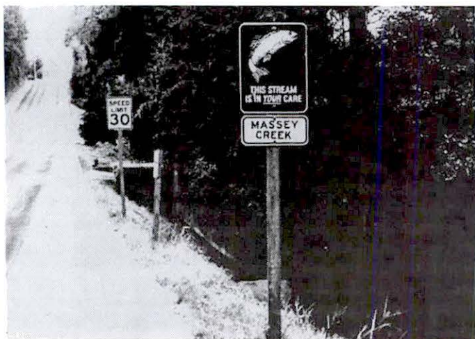
culvert carries Massey Creek crosses underneath 20th Ave. S.

Massey Creek has been heavily influenced by the Pacific Highway corridor and adjacent development. Several sec-