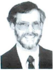
Scott Thomasson Mayor